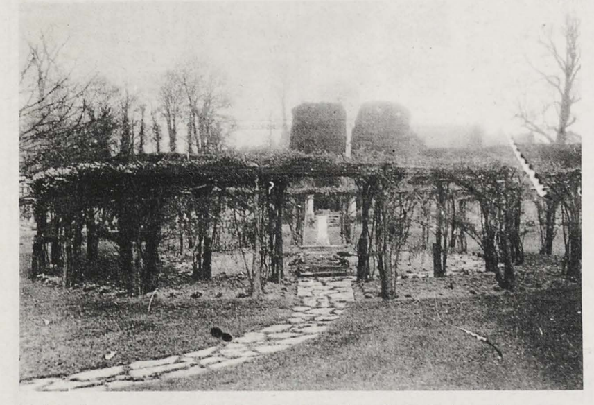
Local people must remember the old rose garden which still remained after the house was destroyed and the garden was first opened to the public. Like the old house, it has now gone.

FOUR more photographs of Caversham Court before it was pulled down in 1933. These pictures were taken by the daughter of Thaddeus Arathoon. The family lived there briefly in 1919. They also had Westdene for a short time, the old house opposite the junction of St Peter's Avenue and Woodcote Road. Another of their temporary homes in 1920 was Caversham Grove, now part of Highdown School.