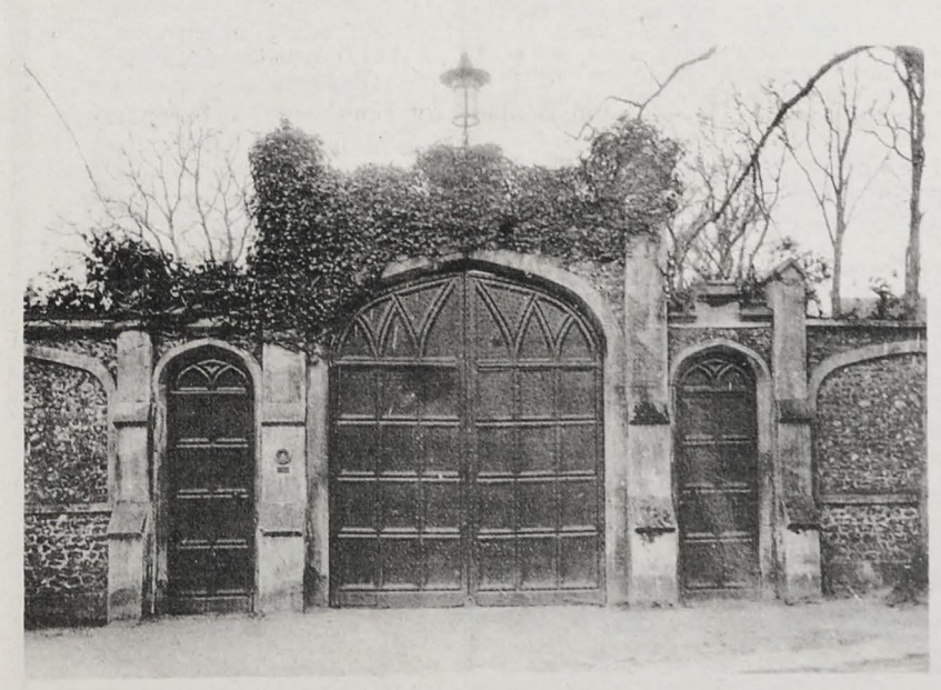
The great gate to the grand house. In the picture it is not possible to see the large iron studs that were part of its ornamentation.