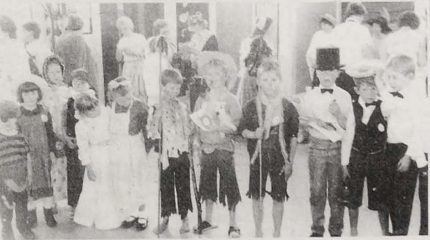
Entries for the Victorian Dress Competition

Traditional Clog Dancing at Caversham Park Fair