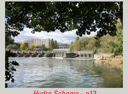
Hydro Scheme – p13