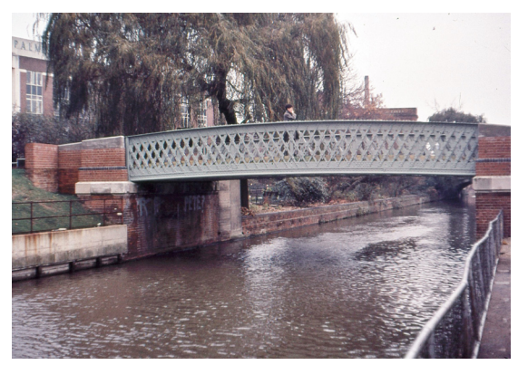
Kennet & Avon Canal Cut and Watlington Street Bridge