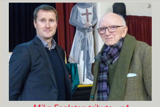
IVIIKE Eggieton tribute – p4