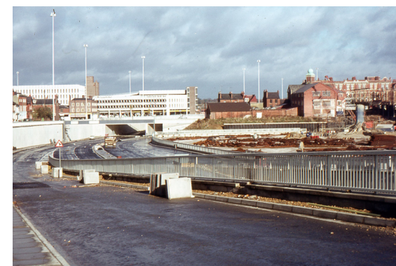
Inner Distribution Road during construction