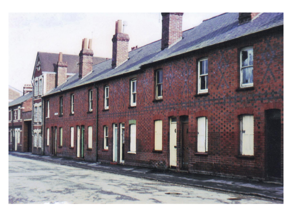
Lost Coley – a view of derelict houses at Flint Street shortly before demolition

by gas lamps". The Turner family were the last residents to leave.