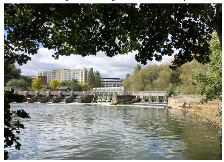
The turbine will be placed under the path and to side of the weir

The scheme will generate enough renewable electricity for 90 average homes for decades to come. Income