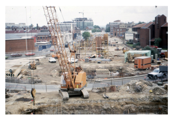
Construction of the Mill Lane fly-over