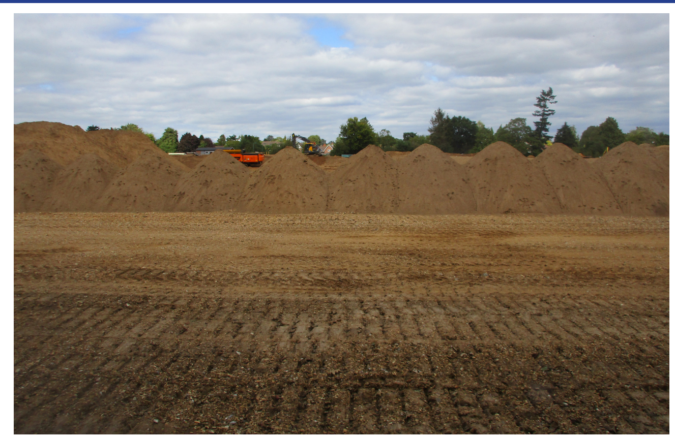
Impressive temporary landscape feature, pending restoration