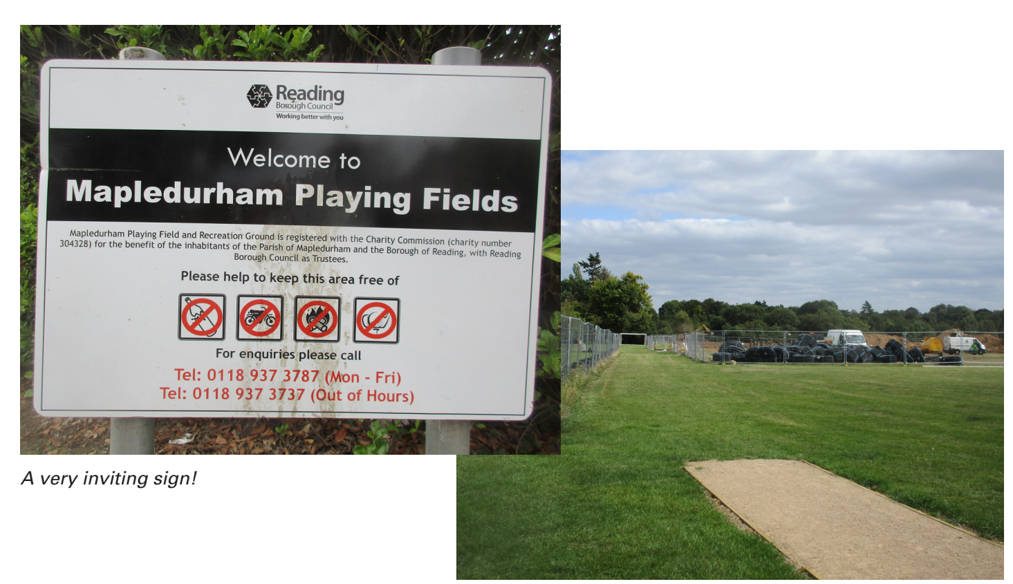
The contractors take over the Fields