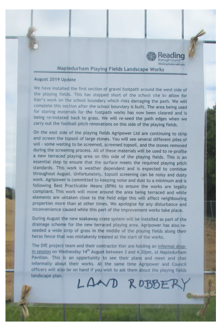
Progress reports are welcome and detailed but not everyone is satisfied!

is an idyllic place when the sun is bright and the grass is green. Well, yes, but this year it is 'memories of times past! No surprise, as CB has covered the new school project (building commences in October) and we are well informed about the playing field as the MPFA has reported for us, and we have covered the 'landscape plan' process. This summer the field is no peaceful playground nor recreational space. Landscaping work has begun with a vengeance. To date about half the area looks like an old East Midlands ironstone quarry. The landscapers are doing the work as required by their contract and the field will not be restored to public use and full access until summer 2020. The school project will provide a further 'industrial' feature in the landscape. To coin a phrase 'it is doing what it says on the box'. The Field will recover but it will not quite be as it was. But final judgment should be suspended. Nonnative plantings, and an illuminated path will be an intrusion on past peace and wilderness. Let's hope the swings outweigh the roundabouts. Citizens, please come and view it for yourselves and make your views felt - there is always time. Meanwhile, the photo essay is a memoir and a narrative of summer 2019.