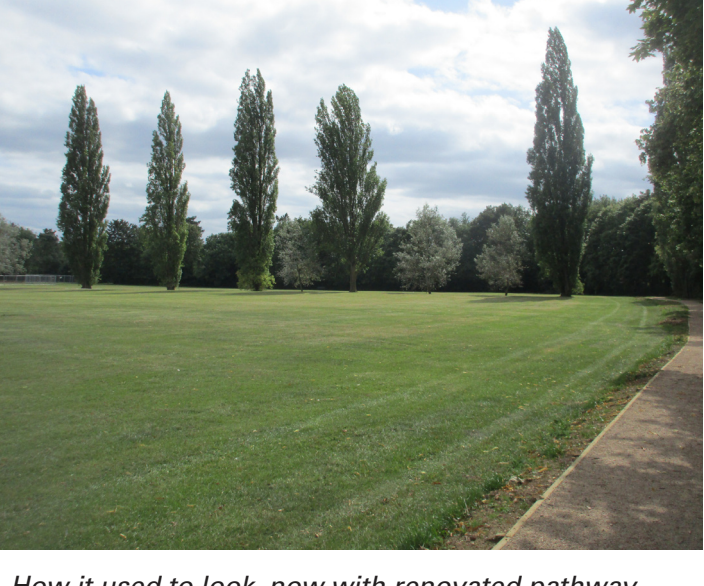
How it used to look, now with renovated pathway