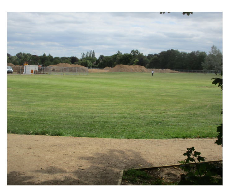
Looking across from Chazey Road