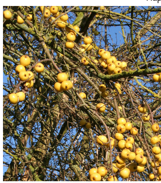
Crab-apples in an Autumn hedgerow