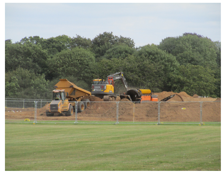
Serious equipment at work