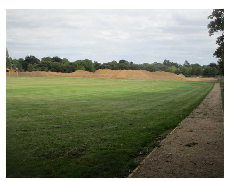
Looks like a quarry now, but it will be restored