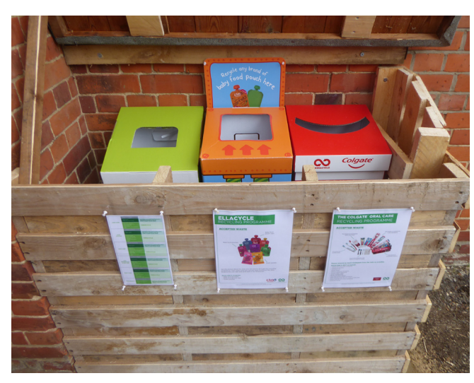
The recycling station

Caversham Heights Methodist Church – Phil Chatfield <u>pchatfield@waitrose.com</u>