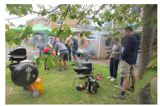
Stoking up the barbies!

Woodford Close held a street party on Saturday 7th September. Located between Woodcote Road and Conisboro Avenue, Woodford Close has seen a natural demographic turnover in the last few years. Some 'originals' remain