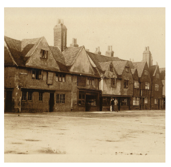
Timber frame houses at St Mary's Butts, Reading

[Contributed by the History of Reading Society]