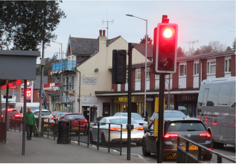
'Day Lewis pharmacy and Sub-Post Office in Church Street'

services of the NatWest bank; the motor supply shop has been replaced by a physiotherapy clinic; Suprema the dry cleaners closed; several units in the precinct are vacant, and we are losing one pharmacy. The year has also seen the closure of the Priory Avenue GP surgery. The centre used to have 'a proper newsagent' where Costa Coffee now stands. As always, it is 'swings and roundabouts' and retail variety depends as much on small enterprise as on branches of national brands. We still have Jennings the butchers and a number of café and food concerns which add good notes to day and night life in Caversham. So, let us see what