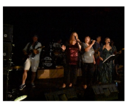
Not Souled Out opened the evening with a stunning performance