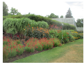
A fine herbaceous border and the Temperate House

companionship and shared experience and can call forth a special lunch and the after lunch speaker too. But going once in a group may well promote an individual