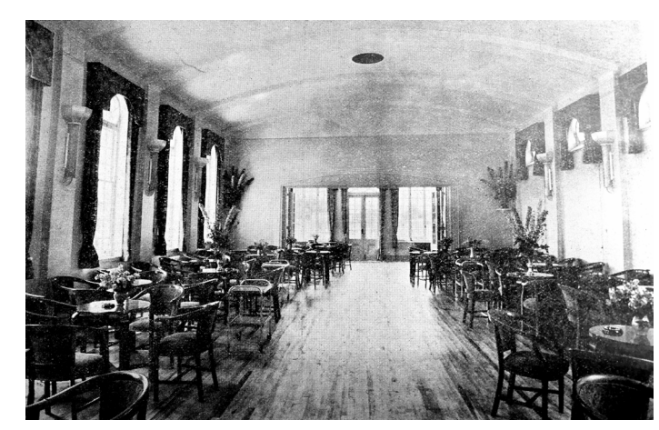
'The Ballroom at the Grosvenor as it was'