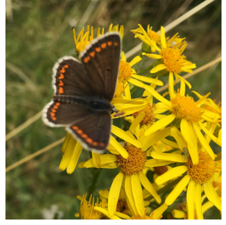
Brown Argus butterfly on ragwort