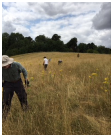
Volunteers at work