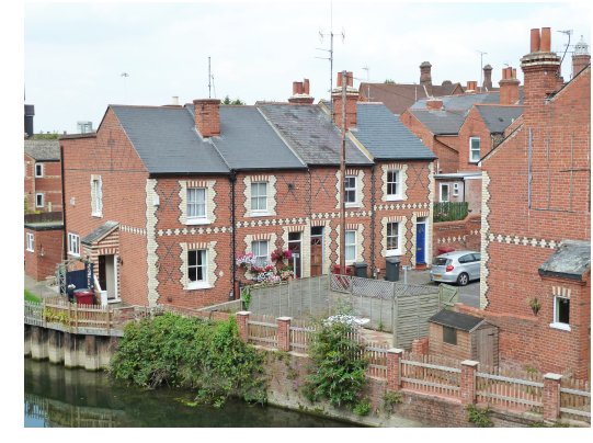
Victorian terrace houses

Evelyn showed slides of some of the earliest maps of the area: on the John Speed map of 1611 the most prominent landmark was Katesgrove House. One of its residents, French exile Count Charles Jean d'Hector, participated in the unsuccessful military campaign to restore the monarchy in France after the revolution. The house was sold for \pm 1,000 in 1873 then demolished to make way for Katesgrove School. We were shown an