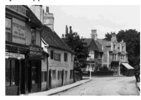
'Old Church Street'

Dorothy stepped down from the day-to-day