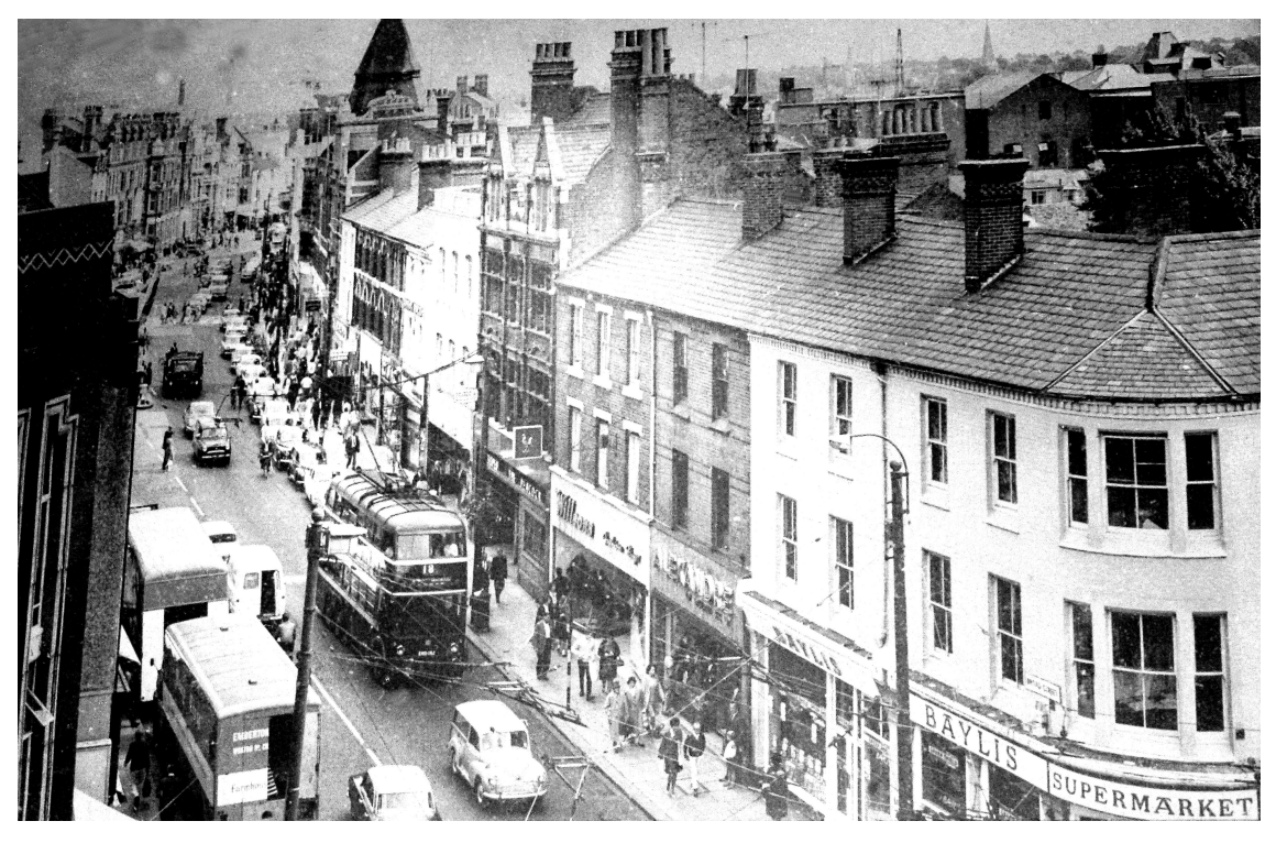
'Broad Street in Reading in the 1960s'