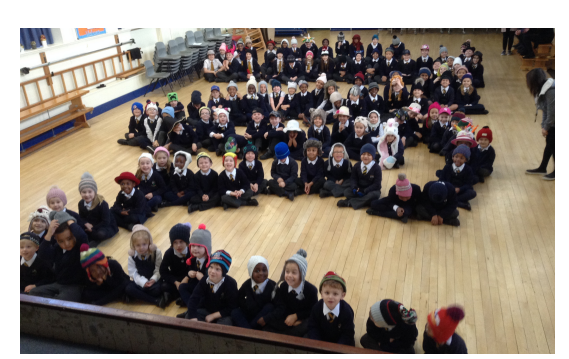
'The children wearing their woolly hats'.

homeless people get off the streets and all children and staff were asked to wear a woolly hat and make a donation to the charity.