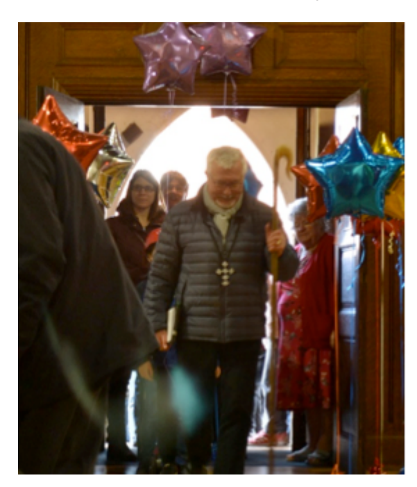
Arrival at St John's