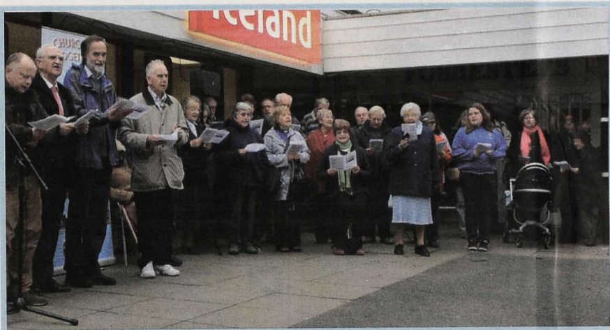
Singers from Caversham churches at the Precinct.