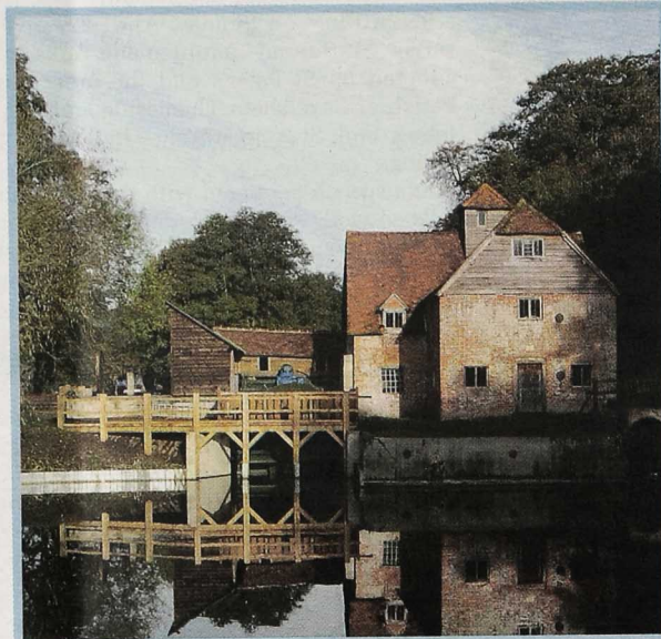
The watermill at Mapledurham House

citizens. Children under five will be admitted free. A family ticket for two adults and two children will cost £20. Call the Mapledurham State office for tickets on 0118 9723350.