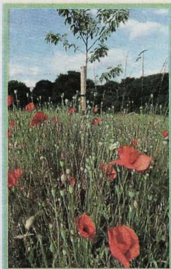
Poppies in Clayfield.

Despite the wet June, July started off hot and dry. Clayfield Copse and Mapledurham playing fields have been full of a huge variety of colourful flowers and butterflies. Mapledurham volunteers had a session recording the different species, the red poppies put on a wonderful display between the fruit trees. Friends of Clayfield were excited to find another species of orchid, among the many flowers there, making three different species over the last three years. They are temperamental plants, here one year not the next and seemingly in different places. All volunteers are pleased with the news that Reading Borough are putting in stewardship plans for all their parks.