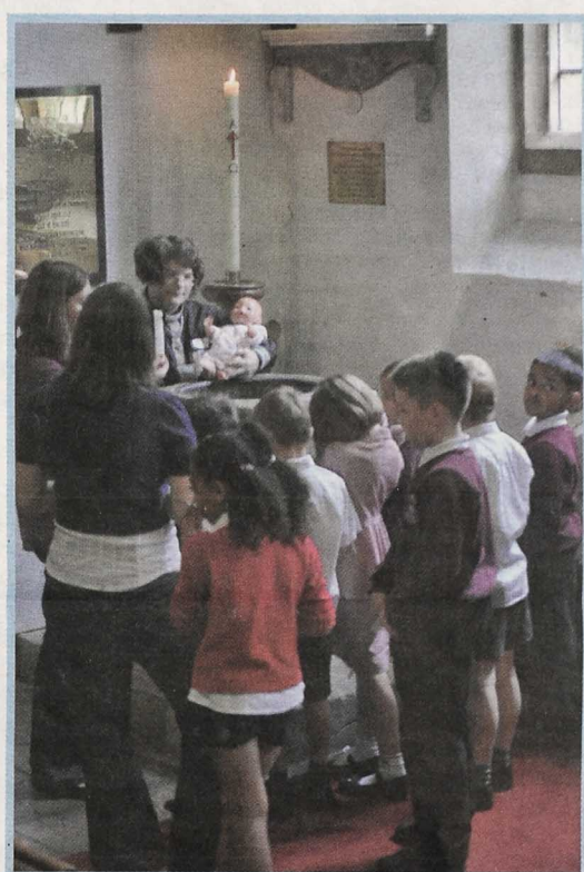
Watching baby doll being baptised at font.