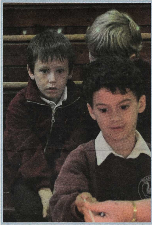
Lighting a candle.

Later in June, Thameside School came to St Peter’s Church for a session on Signs and Symbols. We helped the children explore their own important things and significant places. With the help of volunteers from five local churches, the children investigated four key symbols of the Christian faith. They made a cross with twigs and twine, watched a doll being baptised in the font and made the secret sign of the fish. Learning about the Light of Christ, they each lit a candle and thought about something personal and special.