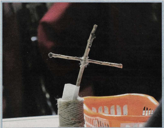
Cross made from twigs and twine.