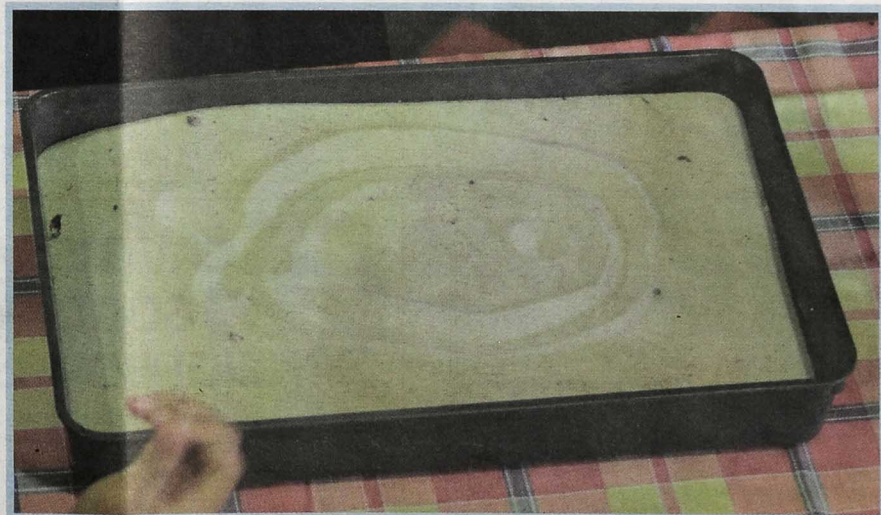
Sign of fish drawn in sand.