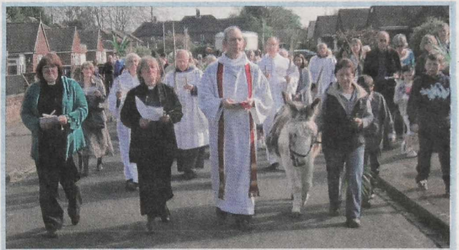
Clergy lead protesting in Kelvendon Way.