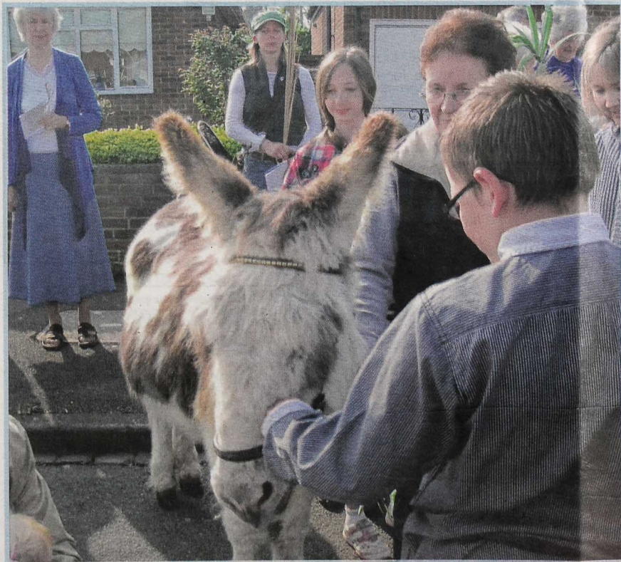
Queenie at the start