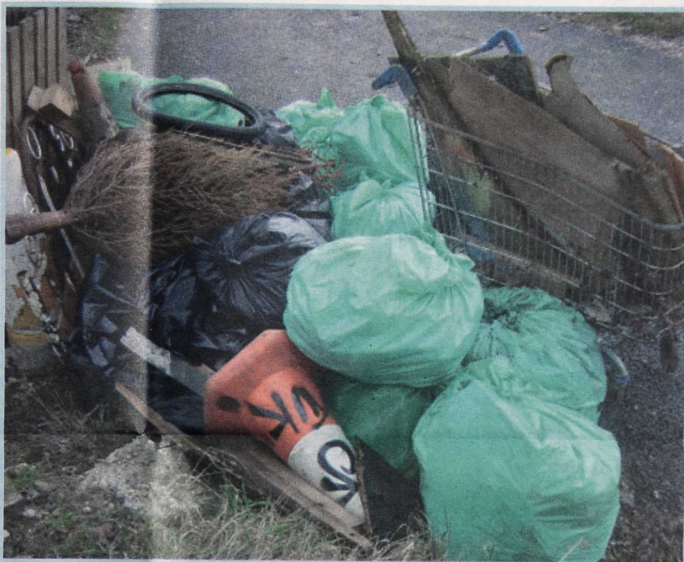
Debris collected in Hills Meadow 2010.

Could you spare two hours to take part in RESCUE 2011? Do you have a hated local litter black spot that you think should be cleared – perhaps a green area, footpath or alleyway? Volunteers are provided with litter picking tools and offered protective gloves. To volunteer, or find out more about the work of the Caversham GLOBE supporters, make contact via ( www.cavershamglobe.org.uk ) or text Richard Denney on 07768 958407.