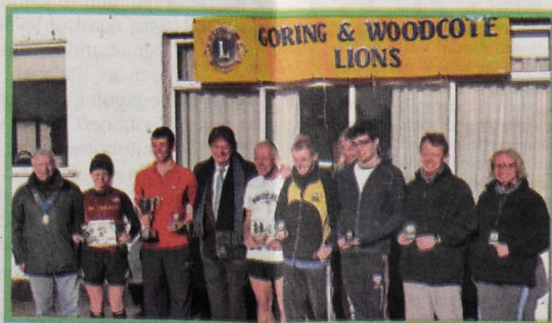
Group of winners with Sir John Madejski.

The proceeds and sponsorship money from this event are still being received, but are estimated to exceed £3,000 and will be split between the local area Macmillan Cancer Support and the Air Ambulance (Berks/Oxon/Bucks).