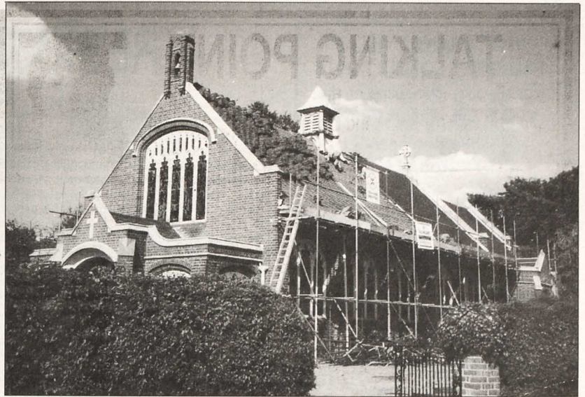
Our picture shows work in progress on the nave roof at St Barnabas Church during August

When completed some 24,000 tiles will have been refixed on the roof of St Barnabas Church. This means that, at a total cost of £18,500, it costs 75 pence to refix one tile. £7.50 would pay for 10 tiles to be relaid and £37.50 for 25; £300 would repair half the vestry roof. If every home in the parish were to give enough money to repair 10 tiles, namely £7.50, St Barnabas would be home and literally dry. Anyone missing the Gift Day and Thanksgiving Sunday opportunities to contribute may