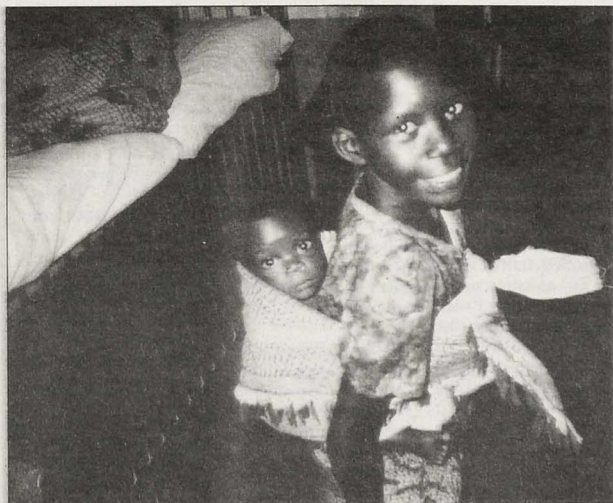
Some of the locals near Kuluva Hospital

All in all I feel the trip was well worth while. It gave me a definite insight into the developing world and some of its problems, as well as a great appreciation for the people I met who choose to spend their lives working in one of the more remote parts of the world without most of the creature comforts we at home take for granted.