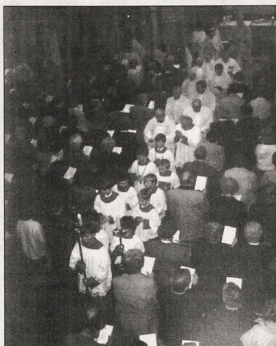
Servers and celebrants leaving the altar.