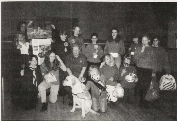
2nd Caversham Guides.