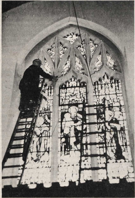
Work in progress at St John's

Everyone is delighted with the result. The plasterwork is all magnolia, and the windows are returned to a light stone colour. The whole church looks fresher and lighter. There is another result, too — the result that comes from many people working together on a common purpose. Fellowship is deepened, enthusiasm is generated, and a new confidence is born in St John's (and elsewhere) in people's ability to do some of those things which in the past have been left to the professionals.