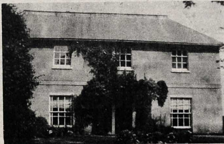
■ Dummy window on top right.

Here's the mobile heater that can help cut your fuel bills