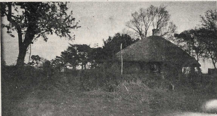
■ The Round House, the lodge at the Elms.