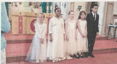
Five children make their first Holy Communion.

Also, on the two last Sundays in May, two groups of children made their First Holy Communion. Five children received the Body and Blood of Christ for the first time on 21st May and two more on the 28th May.