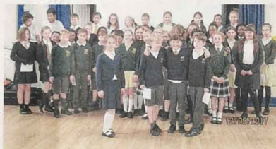
show the two FHC groups