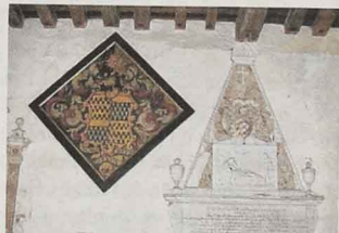
Hatchment and Monument in the Chantry Chapel at St Margaret's Church Mapledurham