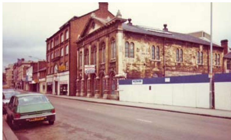
King's Road Baptist Church Reading February 1981