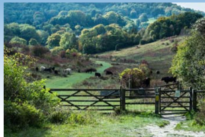
Ridgeway, Pulpit Hill.