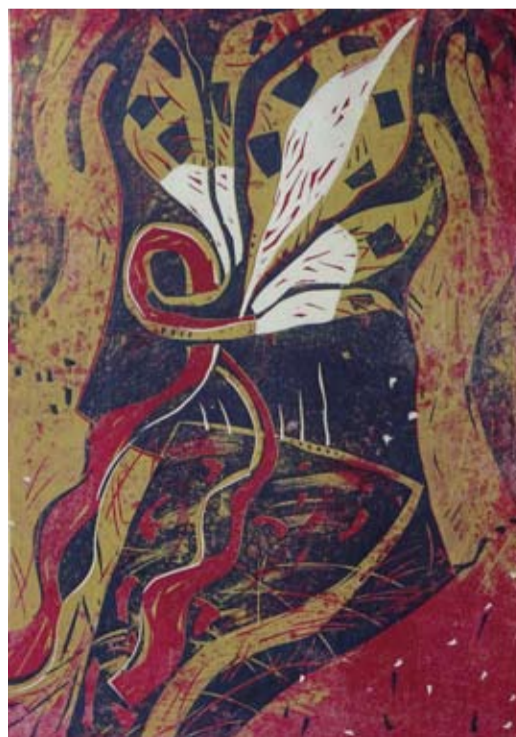
Jacqueline Currell Offering-1

Kitchens & Bathrooms Complete Design & Installation Service Or Supply Only Fully Equipped Showroom 7 Reading Road Henley-On-Thames Oxon RG9 1AB 01491 411990 Local References Available info@steepalofhenley.co.uk www.steepalbathrooms.co.uk