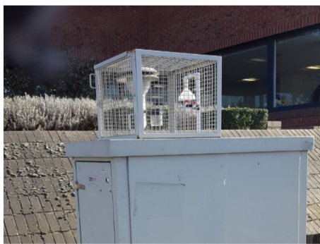
Air quality monitoring station near Caversham Bridge

Residents, cyclists and pedestrians in central Caversham are having to suffer increasingly high volumes of vehicles on our busy narrow streets. The inevitable noise of constant traffic is tolerated by most people, while the silent killer goes unnoticed. That unseen menace is poor air quality. In December 2017 Caversham GLOBE ( Go Local On a Better Environment ) group contributed to the national campaign for clean air by installing a nitrogen dioxide