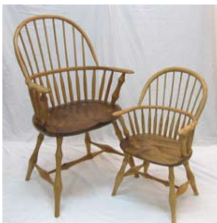
Peter Quarmby full size child's chairs

Facebook www.facebook.com/cavershamartstrail or Twitter www.twitter.com/CavArtsTrail and Instagram www.instagram.com/cavershamartstrail