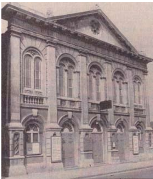
King's Road Baptist Church Reading.

In about 1640 it is thought that a small